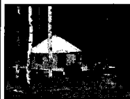
Yurt on 5 acres $65,000