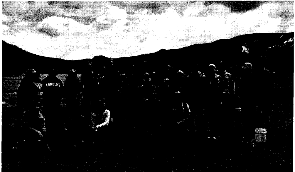
Students from Soroco Middle School planted trees at Stagecoach State Park on May 8.